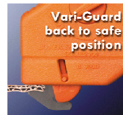
Vari-Guard back to safe position

Push down until front face of knife is in full contact against the box. At this point the Vari-Guard will be fully retracted, exposing straight blade. Transfer all cutting force onto the straight blade.