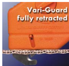
Vari-Guard fully retracted

Start with Boxer horizontal to material. Puncture with hook blade.